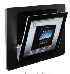
iRoom's iDock landscape

© 2010-2013 iRoomGmbH. All rights reserved. Subject to changes in technical details at any time. The technical details and specifications do not equate to any form of guarantee. All products mentioned protected by international copyright and patent laws.